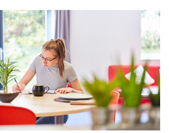
The Green Student Accommodation

Unipol is a campus-based housing agency to provide help and advice on student accommodation.