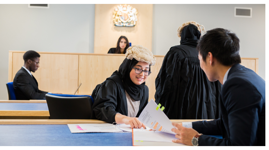
Law Students in the Mock Court